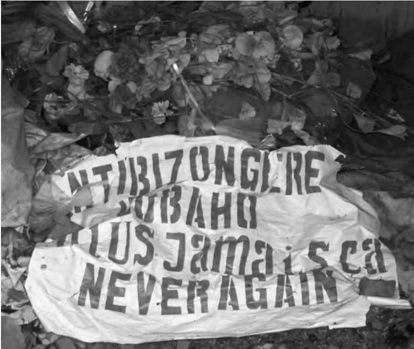
FIGURE 4. “Never again” banner, Ntarama, Rwanda.