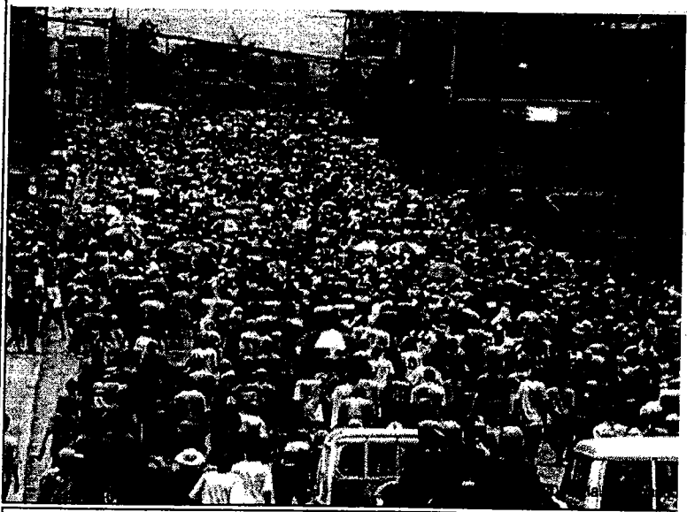
May 18 demonstration continues despite the U.N. allowing masked members of the Haitian SWAT to enter the area with automatic weapons. The Haitian police murdered unarmed marchers on Feb. 28 and April 27 during similar peaceful demonstrations.

At about 8 p.m., SWAT units entered the Petion-Ville market place and began shooting