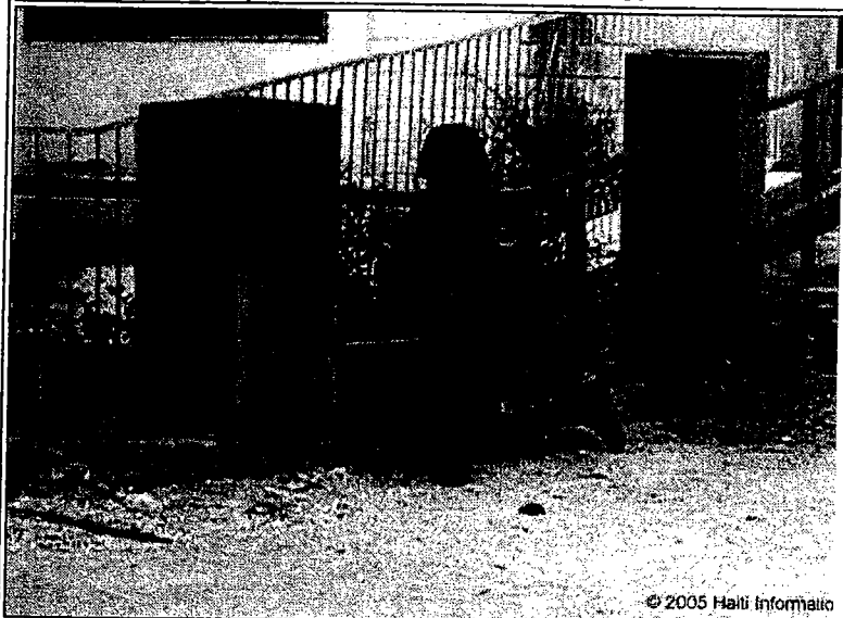
The U.N. allowed Haitian Swat units to line the demonstration route with automatic weapons. It was SWAT units such as this that were responsible for killing unarmed demonstrators on Feb. 28 and April 27. To date not a single officer of the Haitian police has received a reprimand or been charged with a crime in these high profile murders.