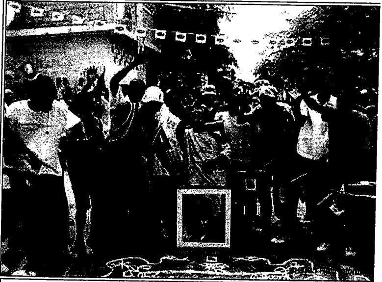
Protestors in Bel Air display a photo of President Jean Bertrand Aristide and make a gesture of five fingers symbolizing his five-year mandate.