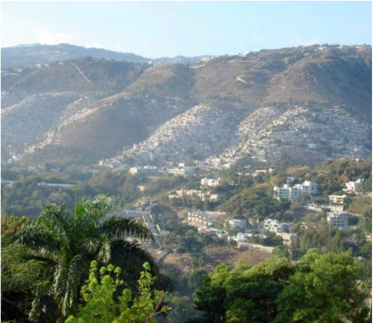
Outskirts of the Haitian capital, Port-au-Prince.