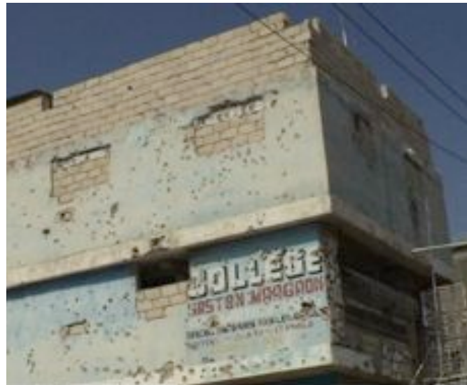
Bullet-riddled walls of a college in Port-au-Prince damaged during heavy fighting in the area between armed gangs and MINUSTAH during 2006.

During her visit to Haiti in 1999, the Special Rapporteur on violence against women, its causes and consequences, Radhika Coomaraswamy, found that “following the military coup d’état, Haitian women continue to suffer from what some interlocutors referred to as ‘structural violence’, targeted at the most vulnerable and poor.” 6 She also reported that between November 1994 and June 1999, the Ministry of Women’s Affairs and Women’s Rights registered 1,500 cases of girls