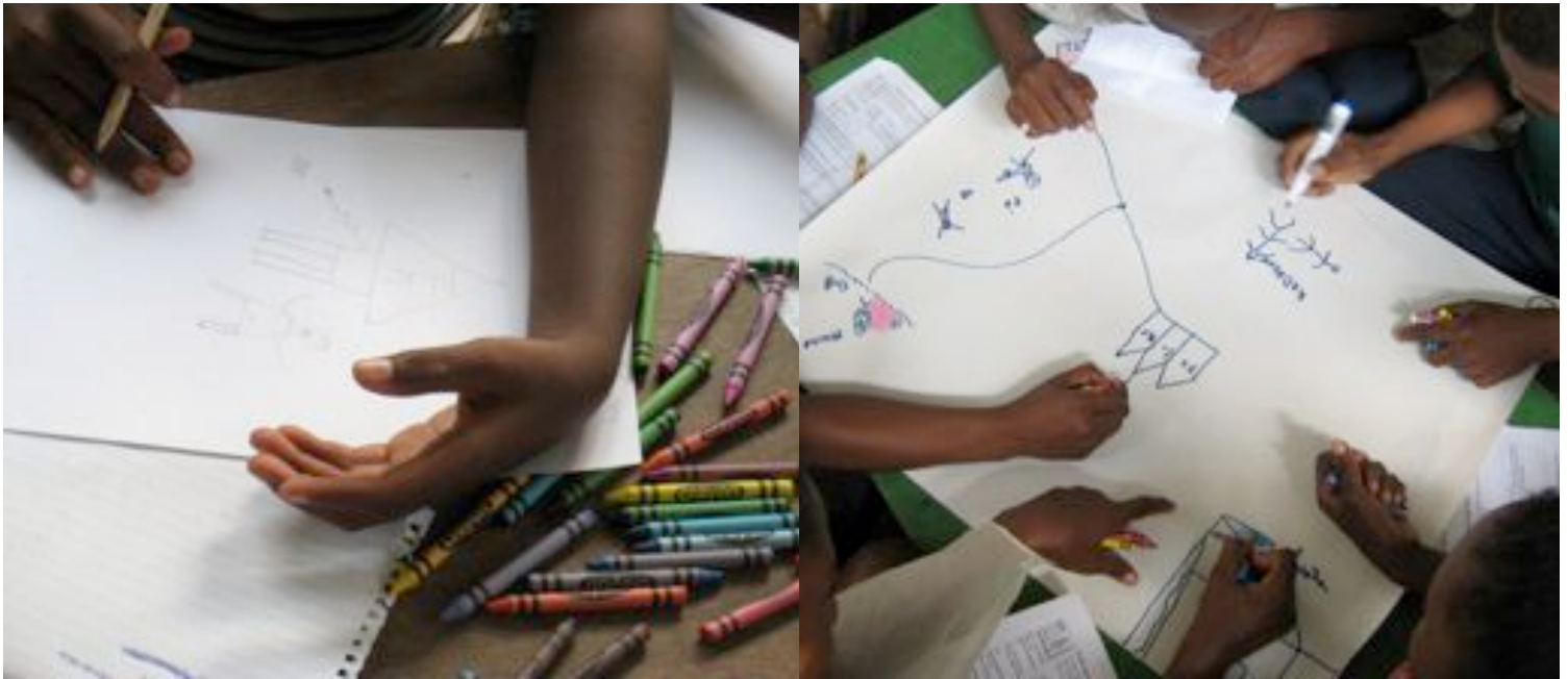
Children taking part in a community mapping session with Amnesty International, Port-au-Prince, Haiti.

Violence in the family often remains hidden. The reasons why survivors find it difficult to report violence in the home and why societies find it so hard to acknowledge and take steps to end it are complex. However, the result of this failure to acknowledge and address the problem is a social climate in which violence in the family is seen as normal, unimportant or inevitable.