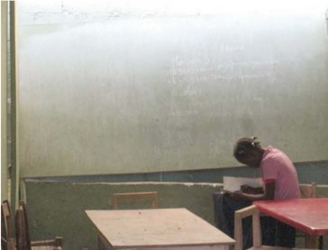
A schoolgirl copies homework from the board, Port-au-Prince, Haiti.

In July 2005, the transitional government adopted a decree introducing minor but significant changes to Haiti's 1835 Penal Code. The Haitian press widely reported the government's intention to modify some articles of the Penal Code relating to rape in order to afford women and girls greater protection from sexual violence. However, despite the entry into force of the decree, 36 the government has yet to establish a legal framework and a national policy to protect women and girls from all forms of violence. Haiti remains the only country in the Americas that has not enacted specific legislation to protect women and girls from domestic violence and one of the few without specific legislation on sexual violence. 37