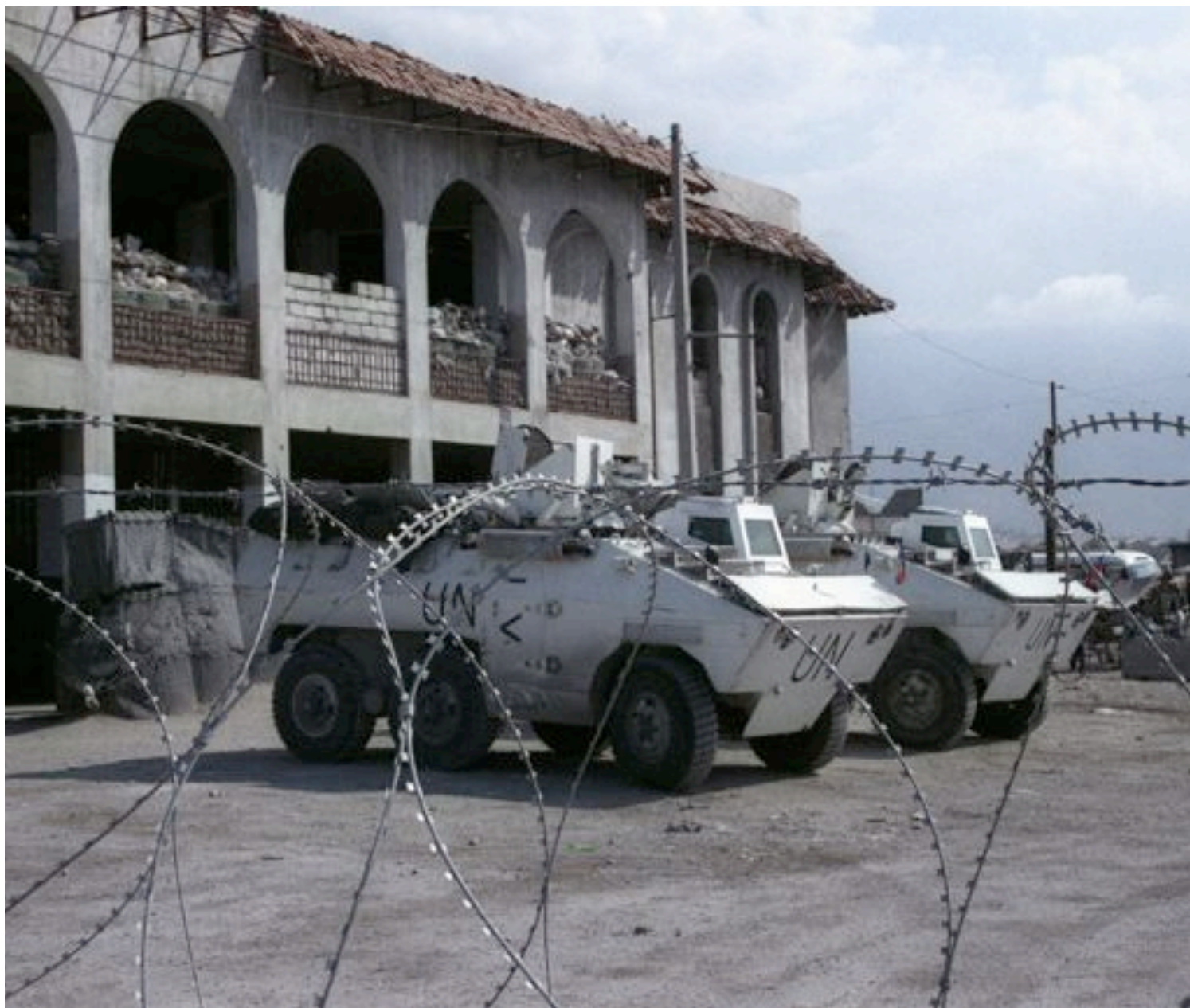
A UN base at the entrance of the Cité Soleil area of Port-au-Prince, Haiti. The base was set up to try to address high levels of gang violence in the area.