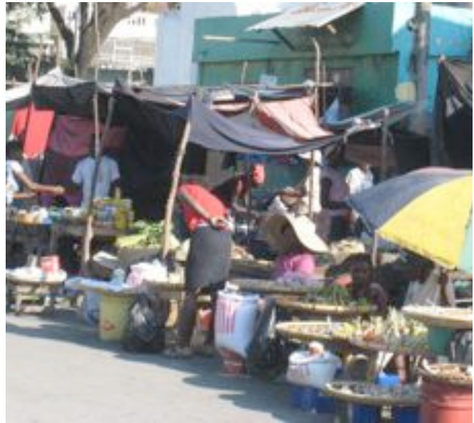
With high unemployment rates, street trading is one of the strategies adopted by many women to survive economic hardship, Port -au-Prince, Haiti.

The Haitian government has endorsed the 1995 Beijing Declaration and Platform For Action. This