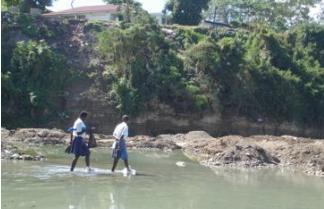
Girls crossing a river on the way to school, Lavanneau, Haiti.

indicate the dimension of the problem... In fact, it is not possible to know at national or regional levels how many women have filed complaints of violence, the outcome of these complaints and the current situation of the victim." 22 In its recommendations to the government, the study highlights the need for a single, unified mechanism for collecting and analysing information on violence against women. Since the study, a standardized form has been developed for use by all institutions in contact with girls and women who have experienced sexual violence. However, at the time of writing, implementation was in the very initial stages.