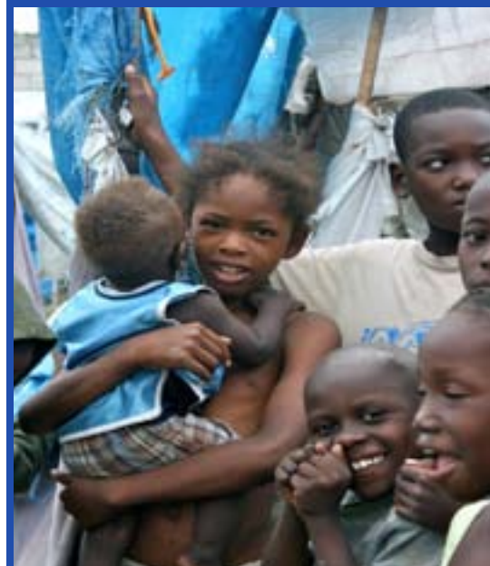
Children in Barbancourt II IDP Camp where IJDH and the BAI have partnered with residents to prevent unlawful forced evictions.

IJDH is leading the fight against evictions in international courts. The Institute is lead counsel representing those at risk of eviction in a case before the Inter-American Commission on Human Rights. On November 16, the Commission issued "Precautionary Measures" declaring the evictions illegal.