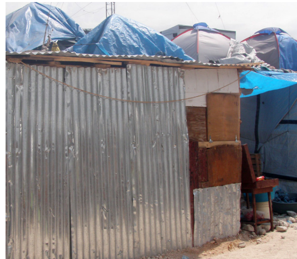
One-room house built for US$300

receive any relocation money. Of the 64 percent who received the US$250, 82 percent said that they still could not afford housing. The money was not enough to build a 12x10 foot shack with a concrete floor, plywood walls and corrugated metal roof, which costs an average of US$300 – leaving many residents without shelter.