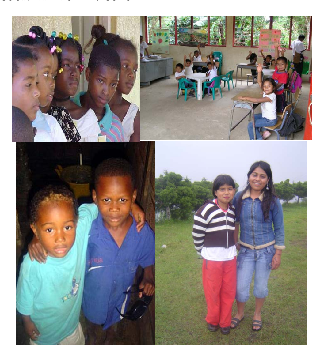
"All children have the right to education as a universally recognized right. However, there are millions of primary school-age children who cannot attend school, and they are therefore in a situation of denial of the right to education, in turn linked to violations of civil and political rights such as illegal work, detainment in prisons, and ethnic, religious, or other forms of discrimination, worsened in cases of children in especially difficult situations such as children who are members of ethnic minorities . . . . " - Inter-American Court of Human Rights, Advisory Opinion OC-17/2002, Aug. 28, 2002, at 38.