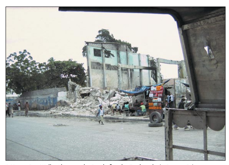
A Young Boy Walks Alone on the Road after the Earthquake in Port-au-Prince.

lated long-standing threat to child protection has been the common practice of sending children away as restavèks (Creole for "stay with") to live with others in exchange for work. An estimated 150,000 to 500,000 restavèks work essentially as unpaid domestic laborers, with little or no access to education or recreation and subject to physical, mental, and sexual abuse.3 The restavèk situation and the practice of institutionalizing children reflect the extreme destitution of Haitian families. Thus, the earthquake occurred against a background of economic extremity driving family separation, aggressive trafficking networks, inadequate law enforcement, and a growing global demand for adoptive children.