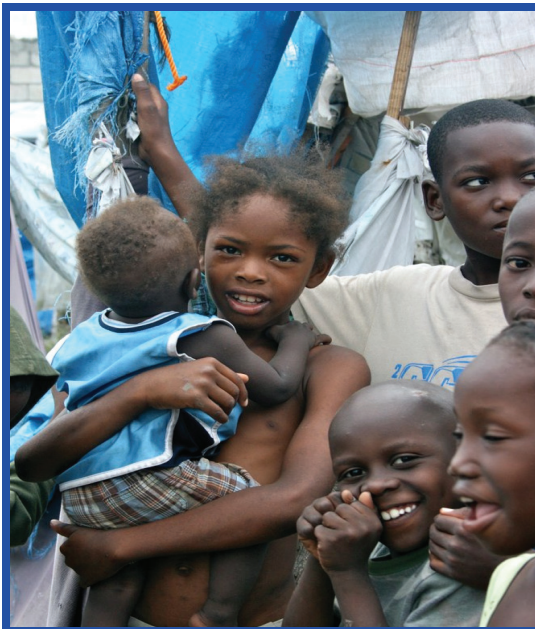
Children in Barbancoeur II IDP Camp where IJDH and the BAI have partnered with residents to prevent unlawful forced evictions.

IJDH is leading the fight against evictions in international courts. The Institute is lead counsel representing those at risk of eviction in a case before the Inter-American Commission on Human Rights. On November 16, the Commission issued "Precautionary Measures" declaring the evictions illegal.