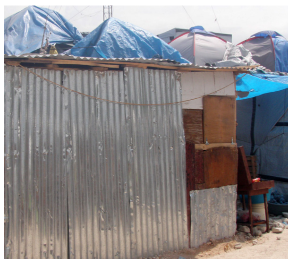
One-room house built for US$300

receive any relocation money. Of the 64 percent who received the US$250, 82 percent said that they still could not afford housing. The money was not enough to build a 12x10 foot shack with a concrete floor, plywood walls and corrugated metal roof, which costs an average of US$300 – leaving many residents without shelter.