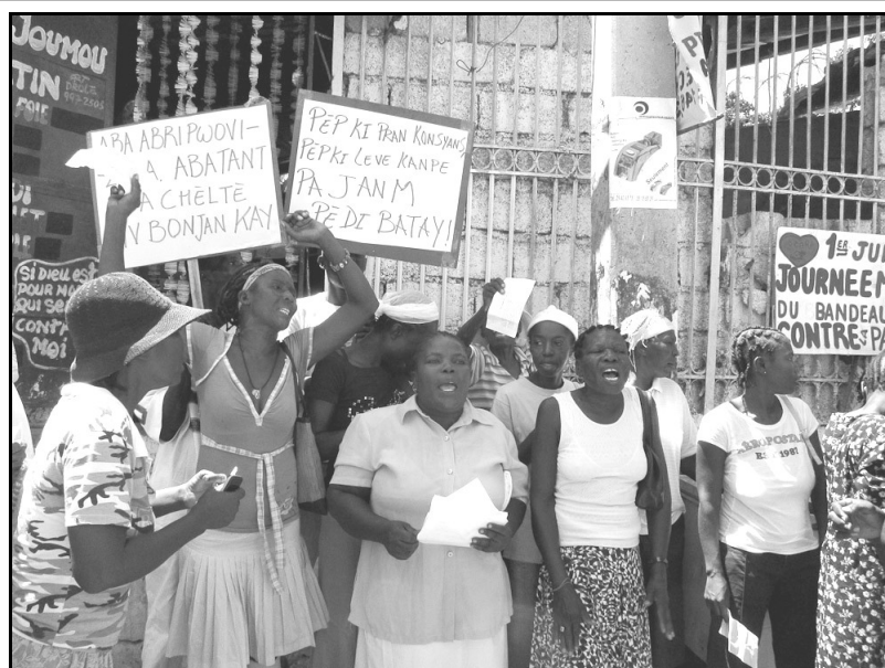
Displaced women participate in a peaceful protest for housing in front of Ministry of Social Affairs. October 3, 2011. Port-au-Prince.