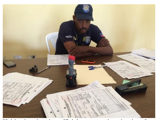
Haitian immigration officials processed a minority of those aboard the buses