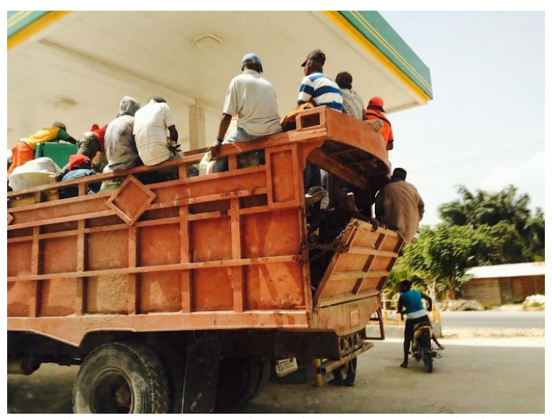
Illustration 1: The passengers of one of the buses were loaded into a cargo truck before crossing the border

On the DR side of the border, we observed a cargo truck – which had previously been used to transport plantains – pull up alongside one of the full school buses parked near the border.