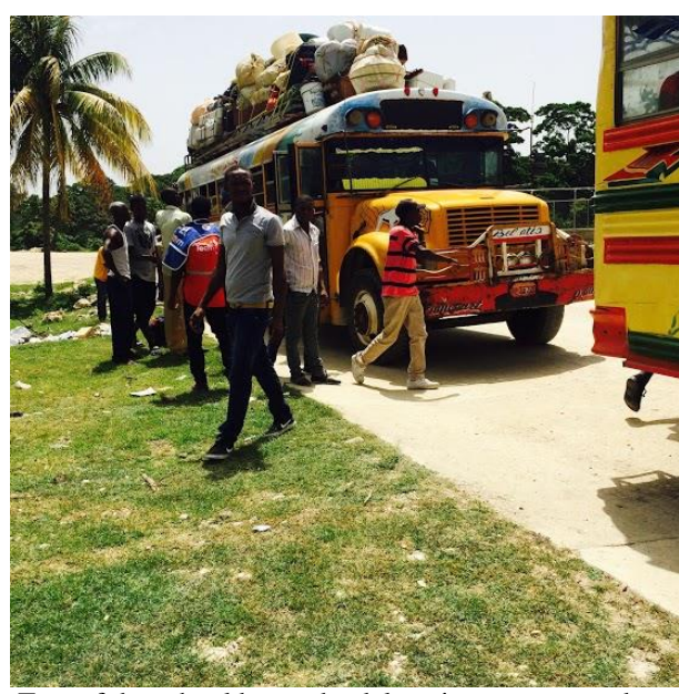
Two of the school buses the delegation encountered at the Belladère border