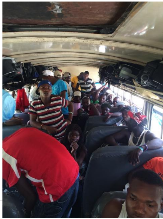
The inside of one of the school buses as it was stopped at the border