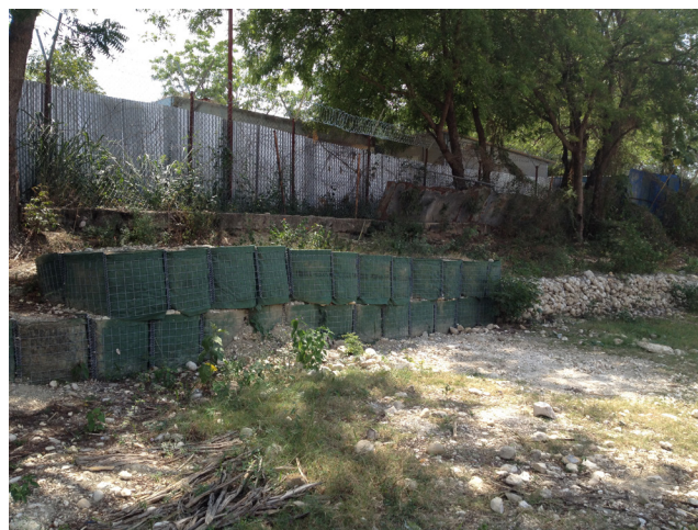
Barricades along the perimeter of the MINUSTAH camp.