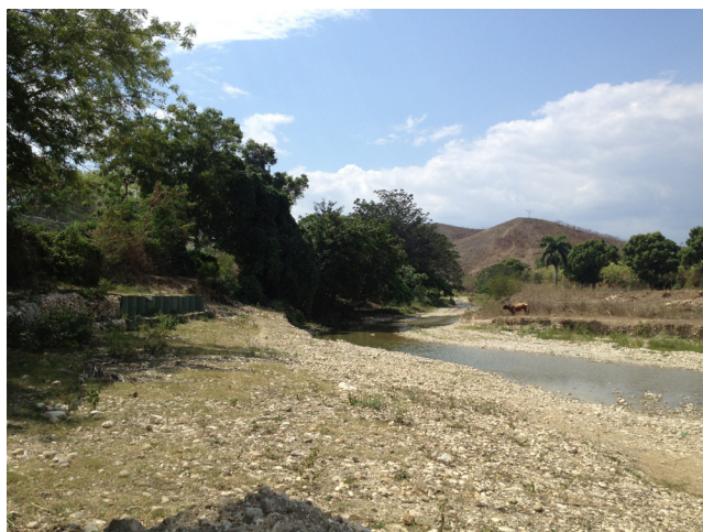
The Méyè Tributary. The MINUSTAH camp is to the left of the tributary. The left-hand side of the picture shows barricades along the perimeter of the MINUSTAH camp.