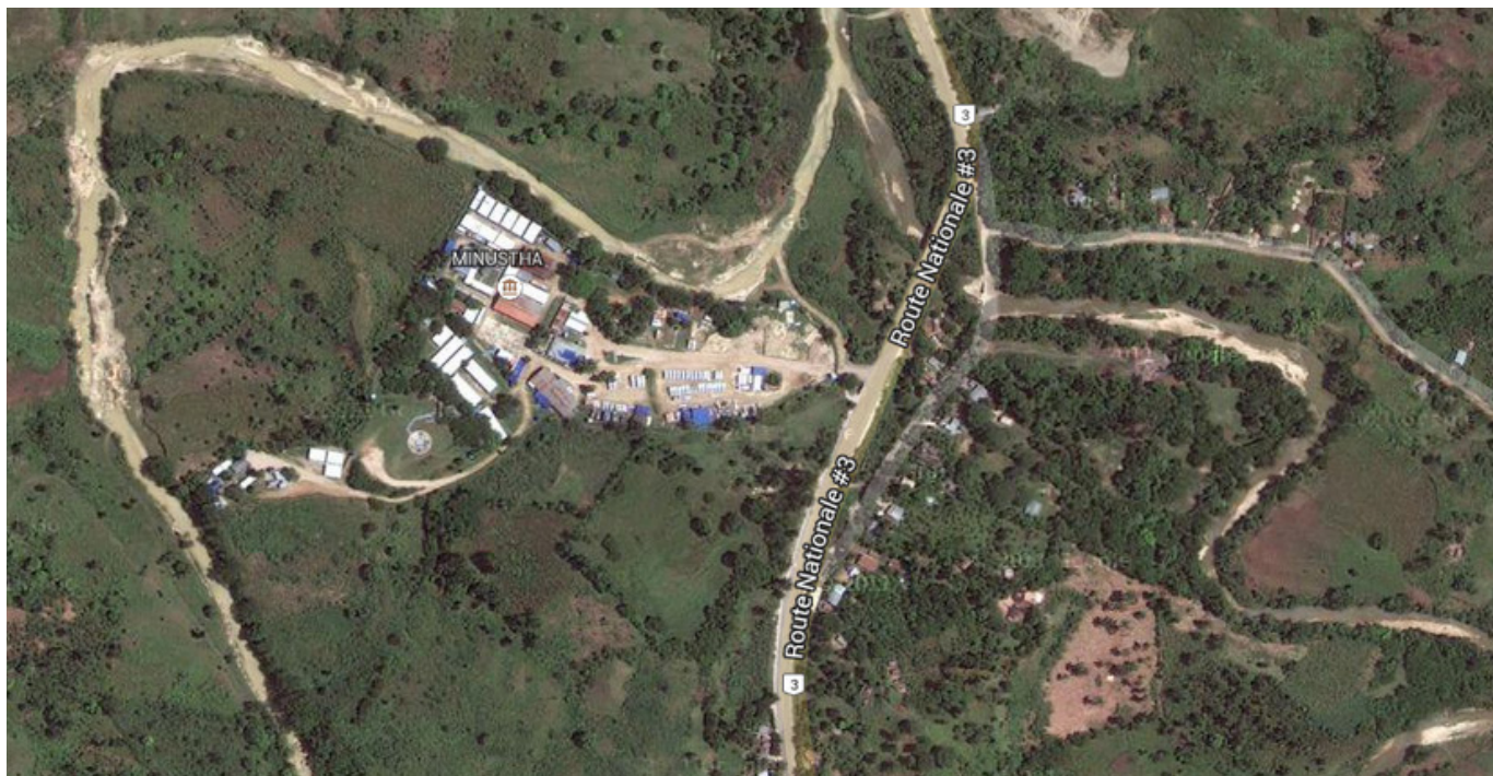
The MINUSTAH base (misspelled “MINUSTHA” on Google Earth) in Méyè, on the banks of the Méyè Tributary.