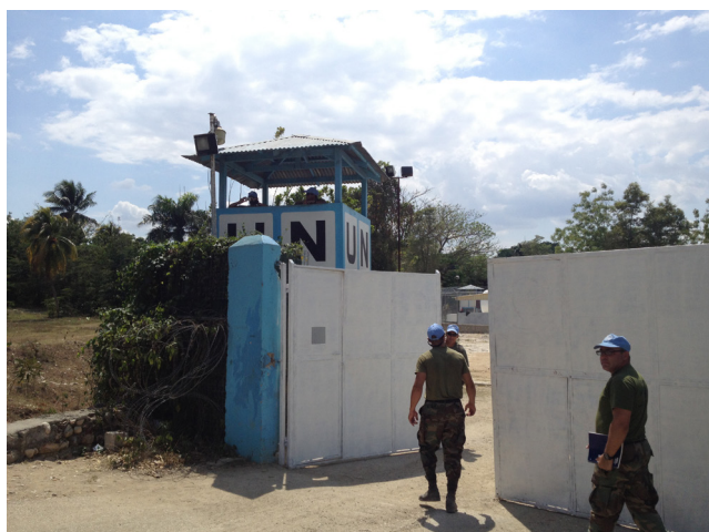
Top: The MINUSTAH base in Méyè.