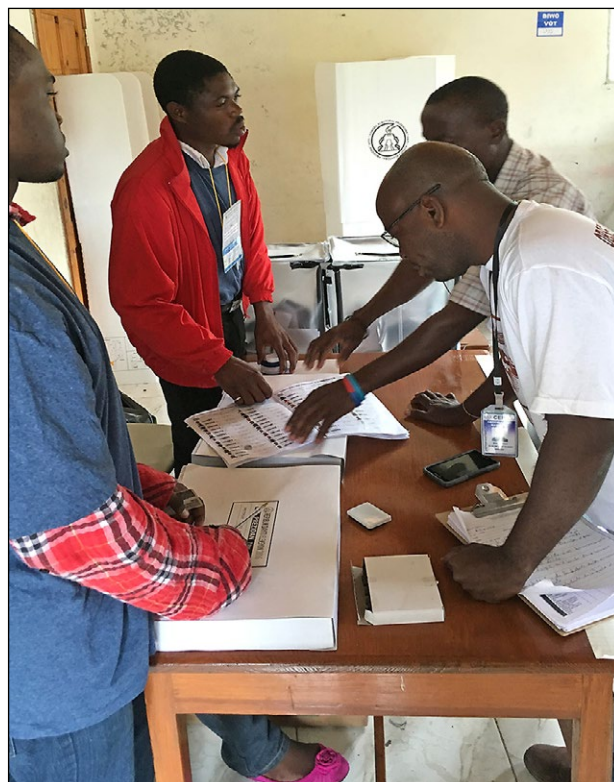
RNDDH observer reviews liste d'émargement .

Ignoring the objections, the BCEN concluded on January 3, 2017, that there was no evidence of massive fraud, but only irregularities that could not decisively affect the electoral process. 109 The CEP published the final results the same day. 110