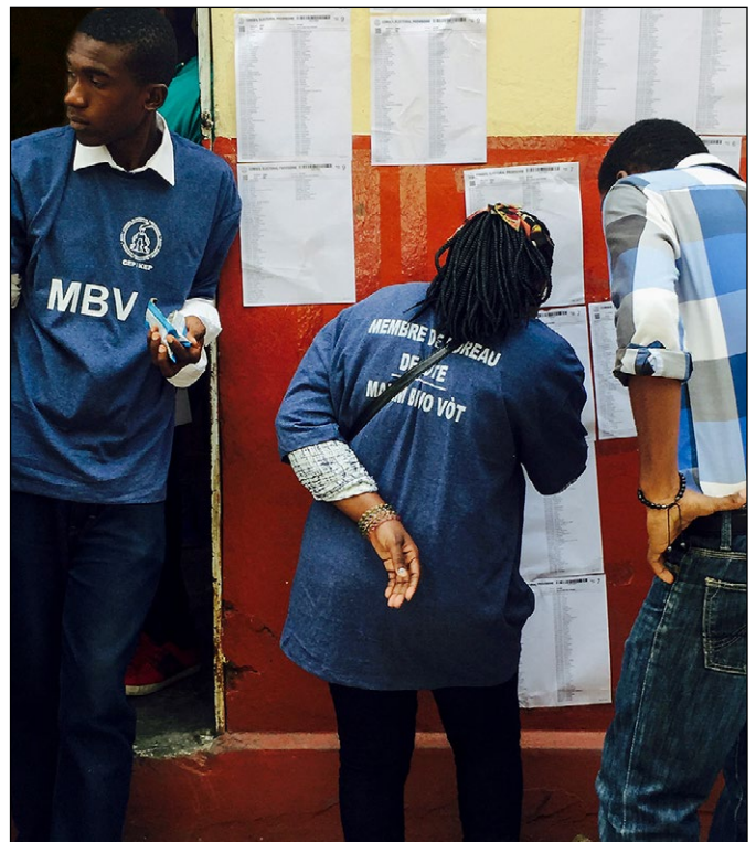
Orientator assisting voter in finding his name on electoral list.

This section provides a description of several advancements in the electoral process on November 20, as well as problem areas that still need improvement.