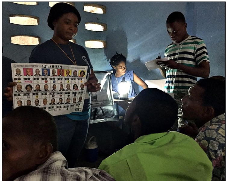
Poll worker verifies ballot to mandataires during preliminary vote count.

The CIEVE had similar conclusions, warning that the "sale and purchase of electoral cards" was becoming a common practice in Haitian elections. The CIEVE pointed to the danger that undistributed cards at ONI offices could be used by individuals who "would pay for the luxury of voting more than once." 66 The OCID was also concerned with CIN trafficking and ballot-box stuffing, stating that proceeding with the vote without fixing the civil registry would be "to waste millions of dollars from the