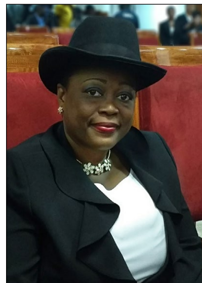
Dieudonne Luma, Haiti's only female senator on January 9, 2017.

With so few women candidates on the ballots, politics continued to reflect a man's domain, as reflected in an even lower voter turnout for women (35.67 percent of voters were women, compared with 64.33 percent