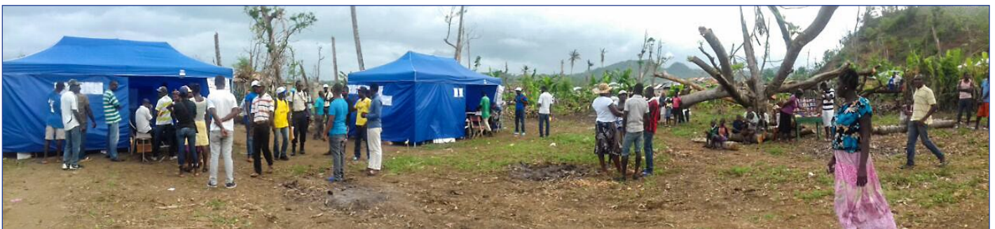
Voting at l’Eglise Catholique Sainte-Claire in Grand’Anse Department.

Despite the tremendous efforts, due to poor pre-existing infrastructure, many roads were still destroyed by landslides or flooded on election day in the Grand’Anse Department. Eleven of the 22 voting centers near Jérémie were inaccessible because of flooding and two were occupied as shelters. Voters were redirected to other locations to vote throughout the region. Delayed materials interfered with the opening of some voting