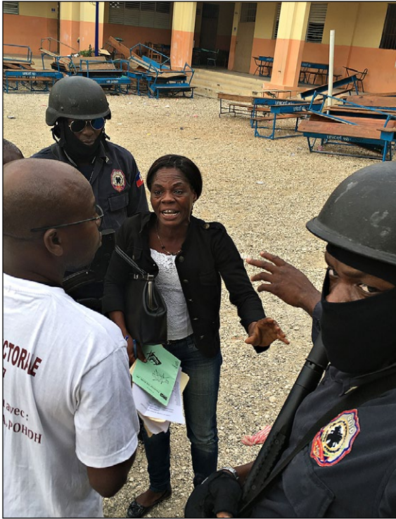
Frustrated voter speaks with RNDDH observer.

Inaccurate and incomplete electoral lists disenfranchised a large, but unknown number of potential voters. At voting centers in Port-au-Prince and Arcahaie (Ouest), the delegation witnessed frequent complaints from voters that they could not find their names on the electoral list posted at the voting centers (partial electoral list) to which they were directed to vote. Another common problem was that voters found their name on the