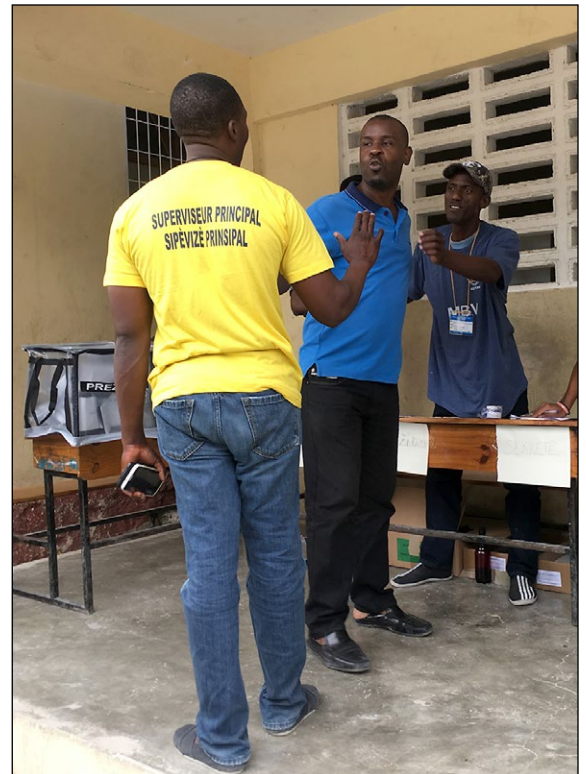
Poll workers diffuse tension with voter.

Many mandataires concealed their badges, either by tucking them under their shirt or blouse, in a pocket, or around the neck and turned over. This caused problems because upon entering a poll the delegation could not determine who was a voter and who a mandataire . Concealing the badge and photo also concealed the mandataires whose photos on the card was not their own. Often when the delegation approached a group of mandataires to question them, one or two would quickly walk away to avoid detection.