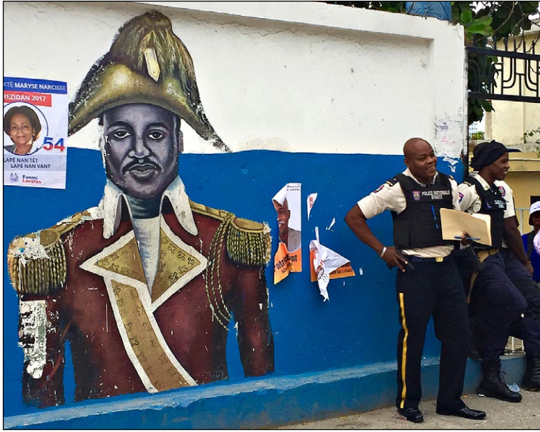
Police outside polling station Lycée Jean-Jacques Dessalines in Port-au-Prince.

shouting to promote their candidate. At one site, trucks drove by with horns, drums and shouting passengers. At Tabarre Lycee Jean Marie , voters could only enter the polling center by passing through a gauntlet of men shouting about their candidates, which was a violation of the electoral decree. 32 There were no partisan demonstrations inside the polling center.