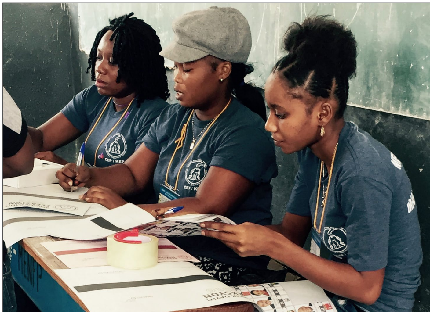
President, Vice-President and Secretary of polling station.