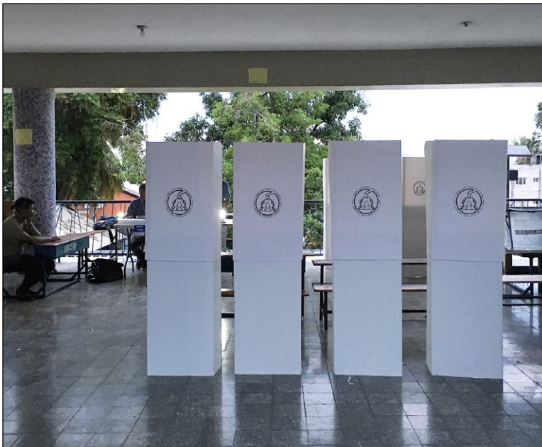
New polling booths.

Poll workers used a new indelible ink that was more difficult to rub off to prevent multiple voting. 26 Voters routinely complained about the messiness of the ink, and some poll workers responded by dipping an index finger instead of a thumb, as required, or by immediately wiping off the ink with a tissue. The ink was still lightly visible when wiped off, but the one-minute drying rule should be enforced. 27