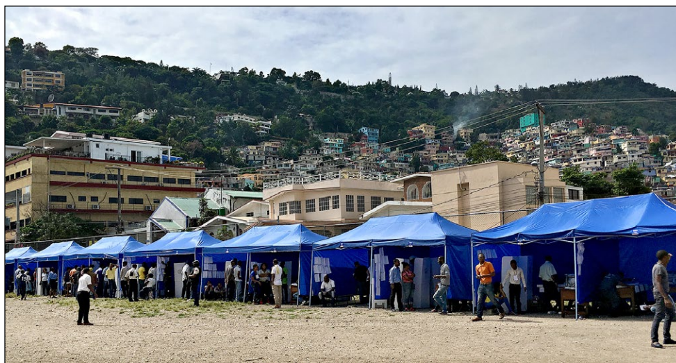
Polling stations in Port-au-Prince.

contains a few paragraphs answering questions such as why vote, who can vote and where. 77 While information provided online is a positive step, internet does not reach most Haitians, as only 11 percent of Haitians used the internet at some point in 2015. 78 Another positive step was an increase in symposiums, mostly in Port-au-Prince, held to inspire civil debate among young adults and other populations. But again, these symposiums targeted a small section of the population.